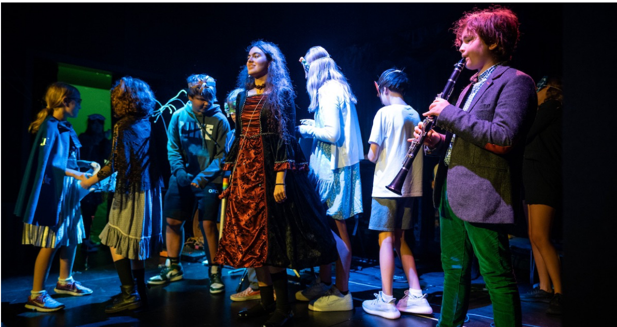
Summer Project 2022

The Benbow Arts Space in the heart of St Leonards will be opening in December 2023. It will be an exhibition and community arts space offering career training to young people.