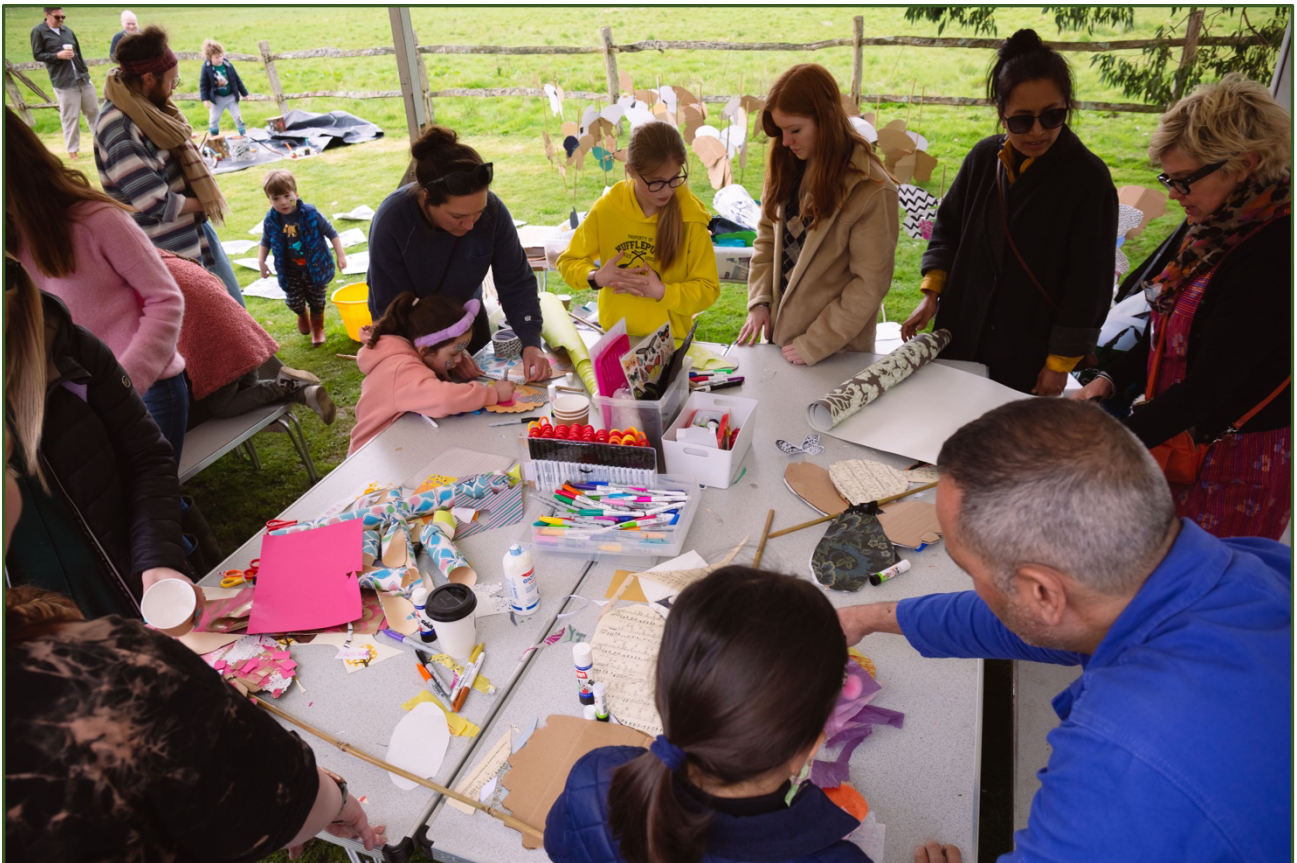
Volunteers helping out on Earth Day 2023

We are happy to provide references depending on the length of your time with us.