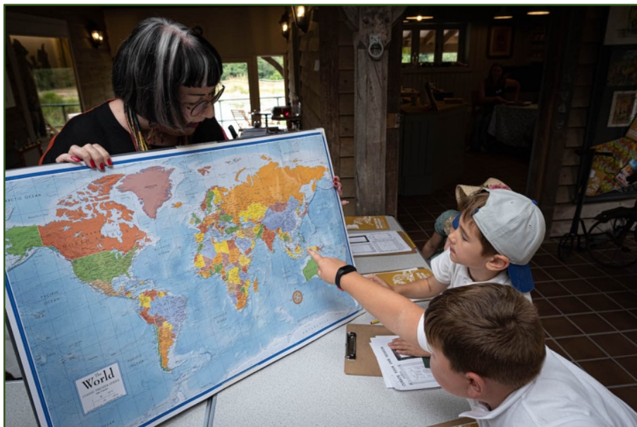
School & Group Experience Days